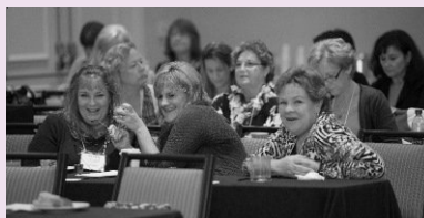
Delegates from Kent Hospital Local 5008