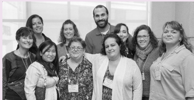
Delegates from Local 5110 Fatima Hospital