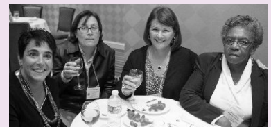
Rhode Island Hospital Local 5098 Delegates