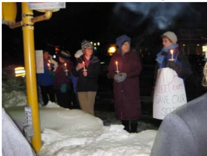
Vermont UNAP members protest State budget cuts

After years of positive and constructive labor relations, the administration of Retreat Healthcare has hired the nationally infamous anti-union law firm of Jackson Lewis to represent them in labor matters. The Union took note of the same firm's failed and disgraced union busting attempt at the UNAP local at HCRS last month ( see related article ). The Executive Board will