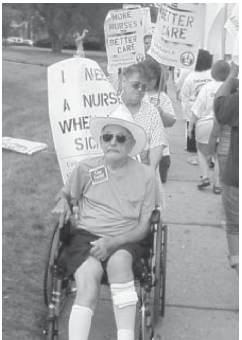
Fatima Hospital UNAP members took to the streets to promote their campaign for safe RN-to-patient ratios